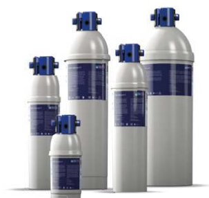
PURITY C Quell ST