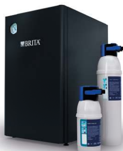
BRITA PROGUARD Coffee