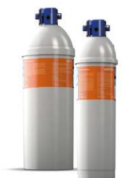
PURITY C Steam