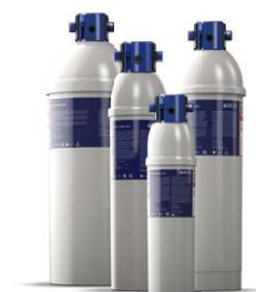
PURITY C Finest