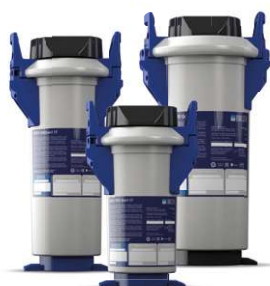
PURITY Quell ST