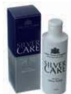
9952 Silver polish