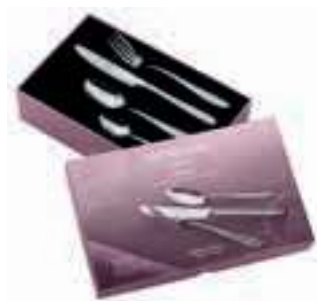
ZMIR1601 16 Piece Cutlery Set