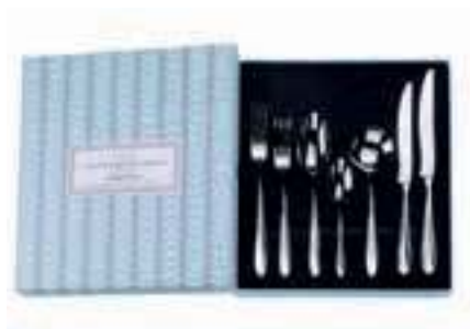
ZSCR1107 7 Piece Place Setting