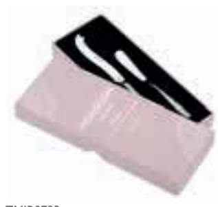
ZMIR0733 Cheese and Butter Knife