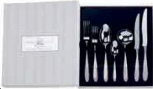
ZSCD1107 7 Piece Place Setting