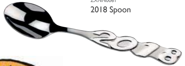
ZXNN0061 2018 Spoon