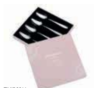
ZMIR0011 4 Serving Spoons