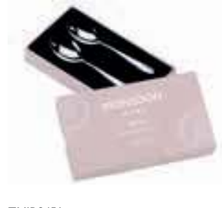
ZMIR0451 Pair of Salad Servers – NEW