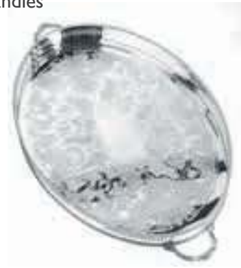
18" Oval Mounted Gallery Tray with Handles