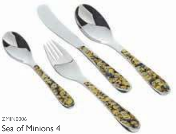
ZMIN0006 Sea of Minions 4 Piece Cutlery Set