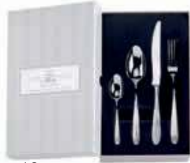
ZSCD2401 24 Piece Boxed Set