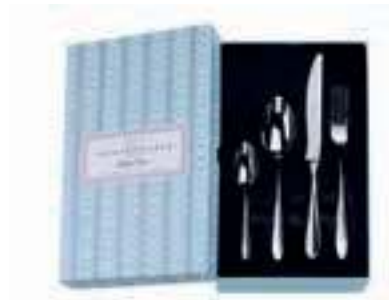
ZSCR2401 24 Piece Boxed Set