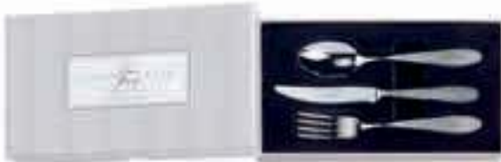
ZSCD3003 3 Piece Child Set