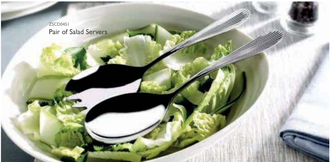
ZSCD0451 Pair of Salad Servers