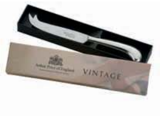
VISS0731 Cheese Knife