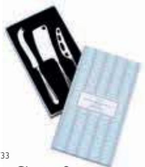
ZSCR0733 3 Piece Cheese Set