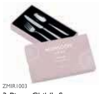
ZMIR1003 3 Piece Child's Set