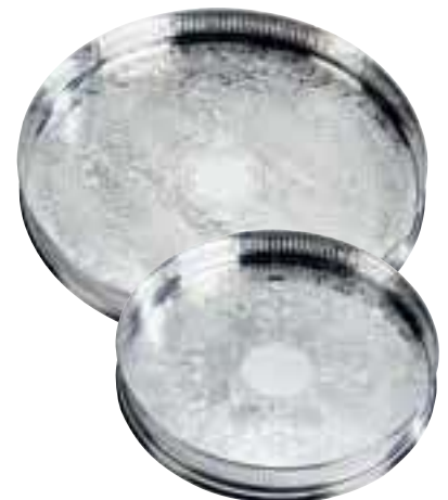
14" Round Embossed Gallery Tray