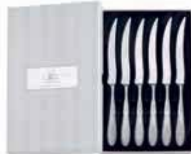
ZSCD0841 6 Steak Knives