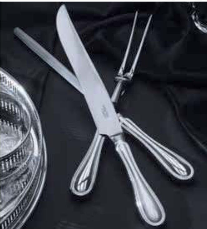
Three Piece Carving Set