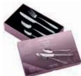
ZMIR2401 24 Piece Cutlery Set