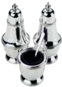
5010 Tall Classic 3 Piece Condiment Set