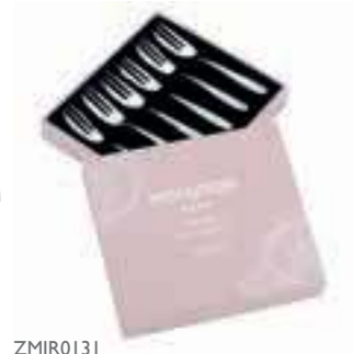
ZMIR0131 6 Pastry Forks