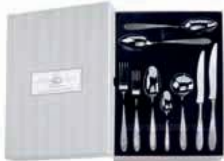
ZSCD4401 44 Piece Boxed Set