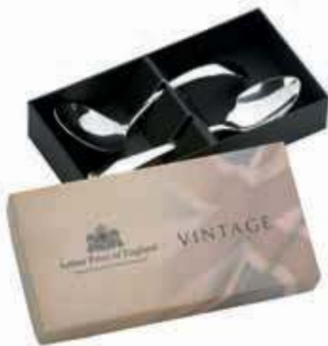
VISS0222 Cream Ladle and Jam Spoon