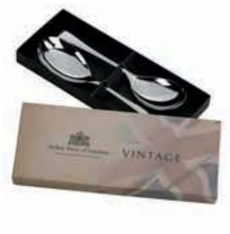
VISS0451 Pair of Serving Spoon and Fork