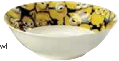
ZMIN0002 Sea of Minions Bowl