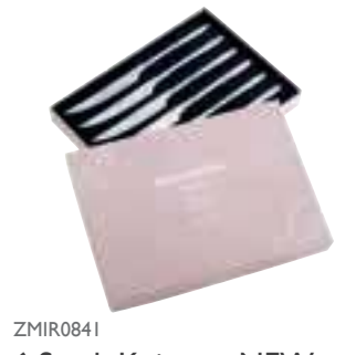
ZMIR0841 6 Steak Knives – NEW