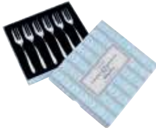
ZSCR0031 6 Pastry Forks