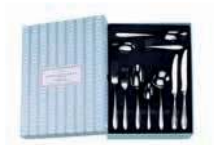
ZSCR4401 44 Piece Boxed Set