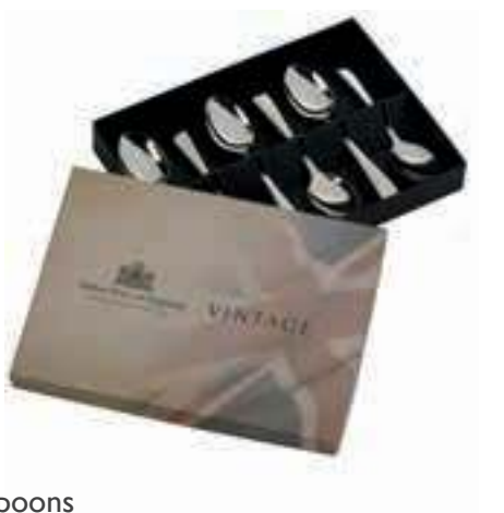
VISS0061 6 English Tea Spoons