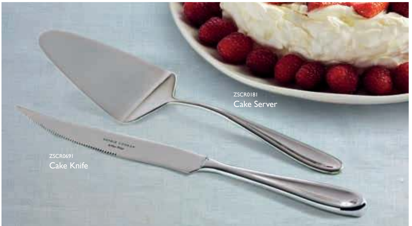
ZSCR0691 Cake Knife