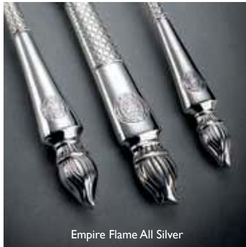
Empire Flame All Silver