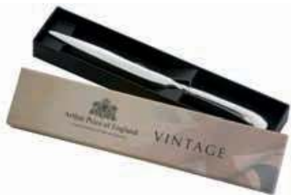
VISS0781 Letter Opener