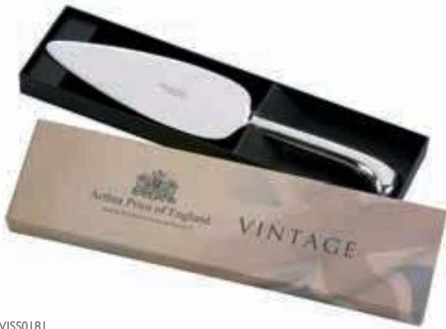
VISS0181 Cake Server

Our Vintage range of teatime accessories is based on the Old English pattern which dates back to the early 1700s and is one of the most famous and enduring designs of cutlery.