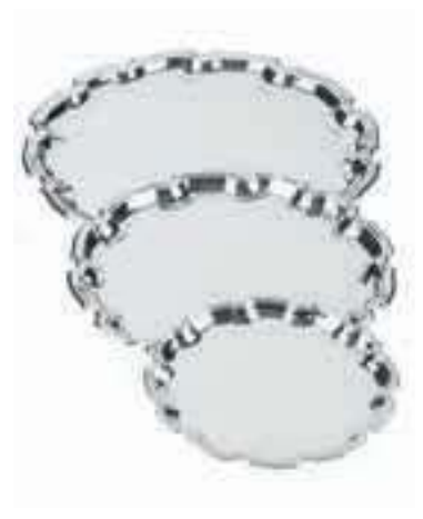
12" Chippendale Salver