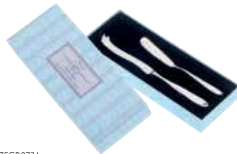
ZSCR0731 Cheese and Butter Knife Set