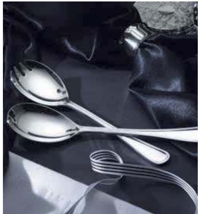
Salad Serving Spoon and Fork