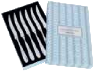
ZSCR0841 6 Steak Knives