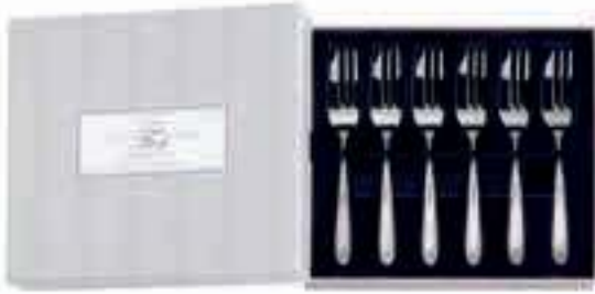
ZSCD0031 6 Pastry Forks