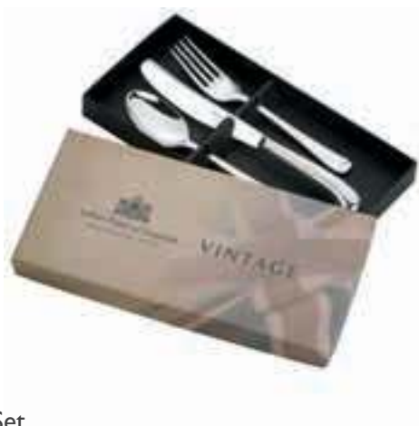
VISS1003 3 Piece Child Set