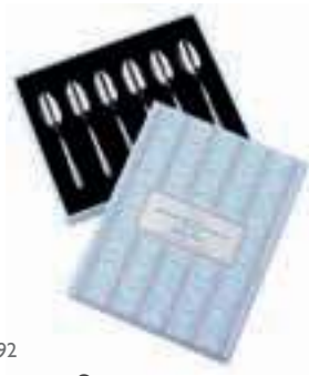
ZSCR0092 6 Espresso Spoons