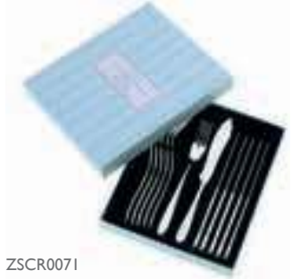
ZSCR0071 6 Pairs of Fish Eaters