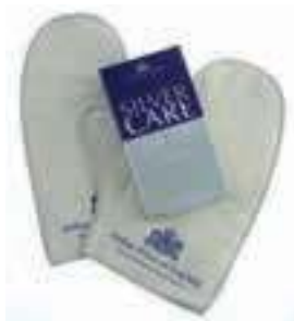
9954 Pair of impregnated silver polishing mitts