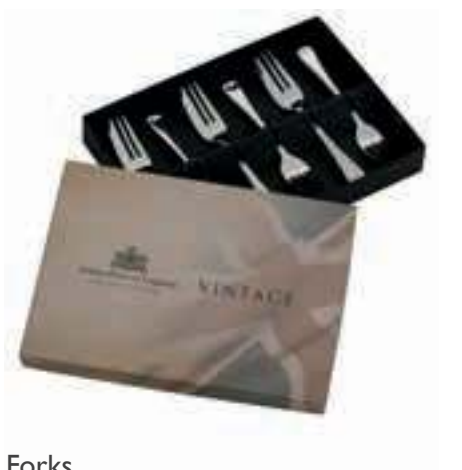
VISS0131 6 English Cake Forks