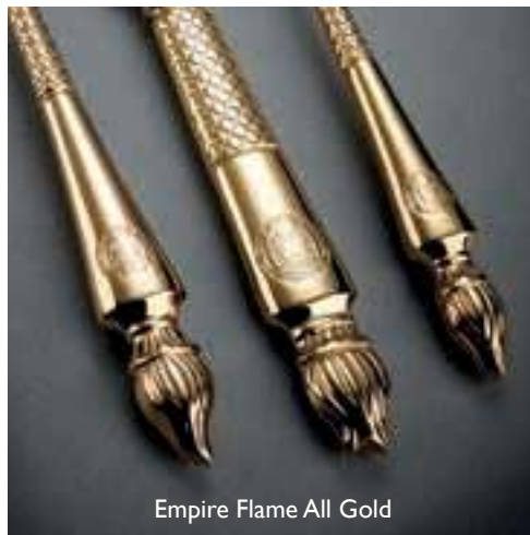
Empire Flame All Gold