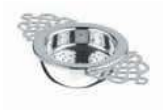
5117 Tea Strainer and Matching Drip Cup

Sizes: Salt & pepper 12cm h; mustard 4cm h; Tray 12.5cm diameter