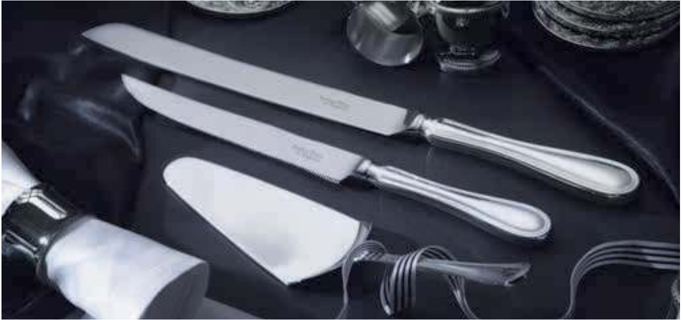
Wedding Cake Knife - Cake Knife - Flange Cake Server

It's the little extras that make a cutlery set all that more special. With Arthur Price of England you can choose from a fantastic range of complementary pieces which will provide the perfect finishing touches to your table settings.