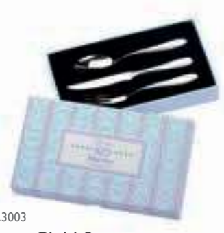
ZSCR3003 3 Piece Child Set