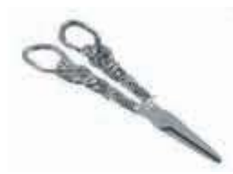
5216 Pair of Grape Scissors