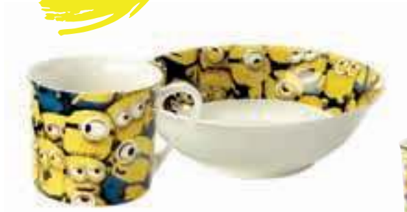
ZMIN0005 Sea of Minions 2 Piece Set (Mug and Bowl)