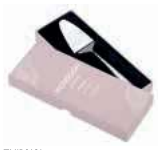
ZMIR0181 Cake Server – NEW