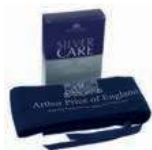
9958 Cutlery storage roll, holds up to 12 pieces of cutlery