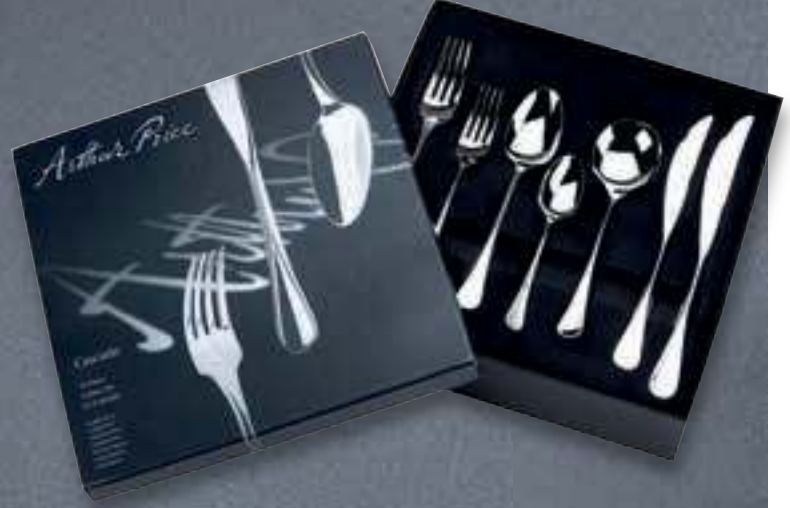
5601 56 Piece 8 Person Gift Boxed Set