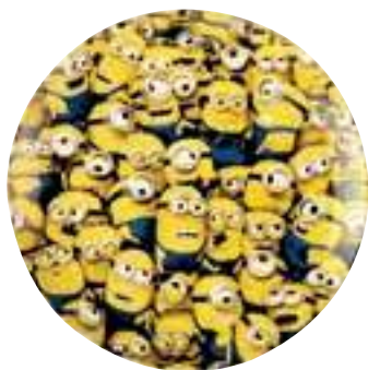
ZMIN0003 Sea of Minions Plate