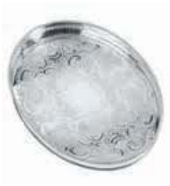
15 1/4" Oval Mounted Gallery Tray