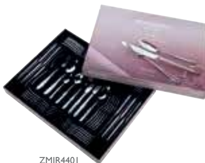
ZMIR4401 44 Piece Cutlery Set