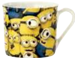
ZMIN0001 Sea of Minions Mug