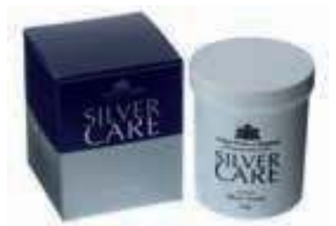
9953 Silver foam