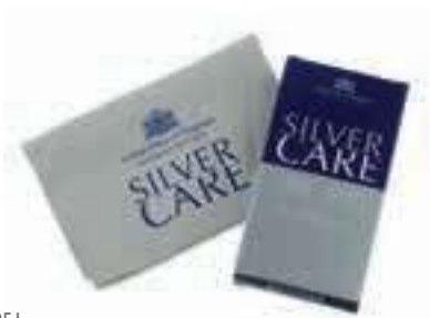
9951 Impregnated silver cloth