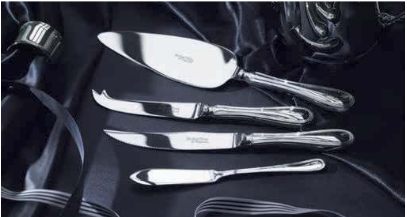
Pie Knife - Cheese Knife - Steak Knife - Butter Knife