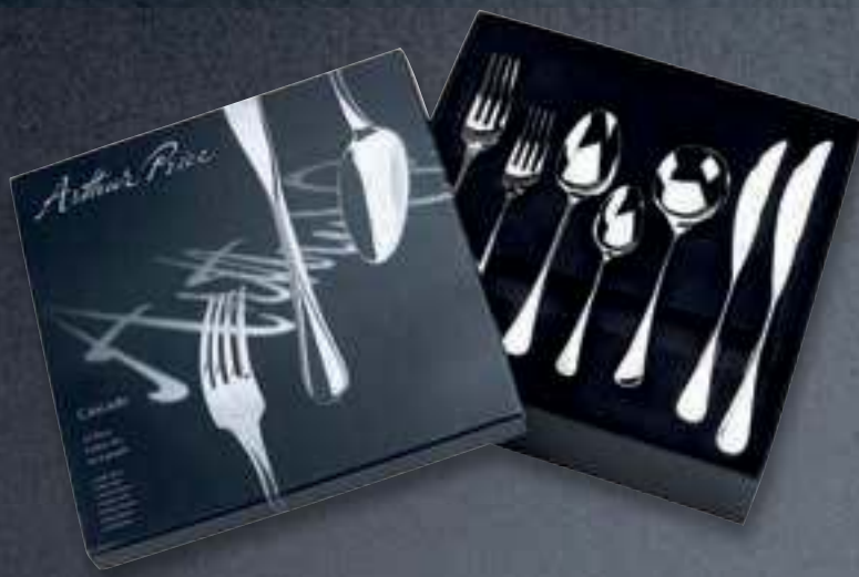
4201 42 Piece 6 Person Gift Boxed Set