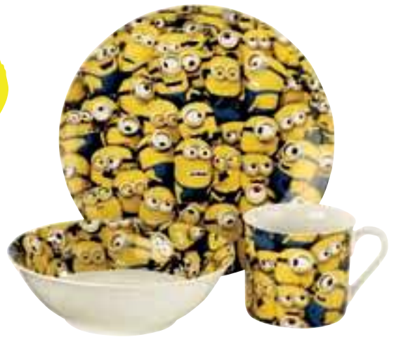
ZMIN0004 Sea of Minions 3 Piece Set