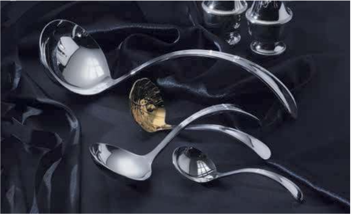
Soup Ladle - Sauce Ladle - Cranberry Sauce Ladle - Cream Ladle