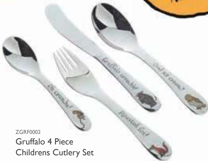
ZGRF0002 Gruffalo 4 Piece Childrens Cutlery Set