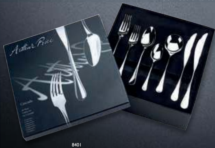
8401 84 Piece 12 Person Gift Boxed Set