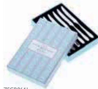
ZSCR0641 6 Tea Knives