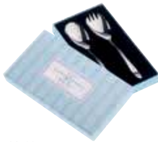
ZSCR0451 Pair of Salad Servers