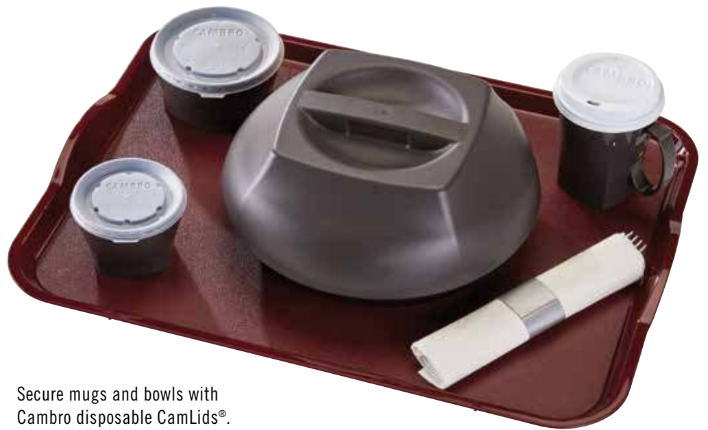
Secure mugs and bowls with Cambro disposable CamLids®.